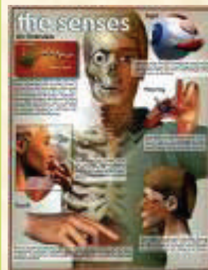
Using all of your senses

a facilitator who helps the client to find unique solutions based on their own life?