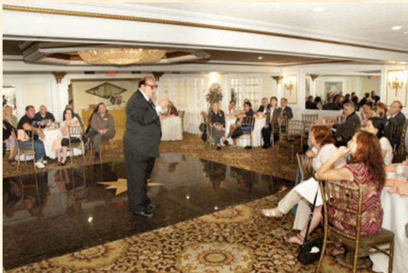
JUNE 16, 2010